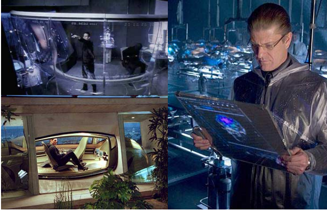
Figure 1. Human environments of the future envisioned in movies: (left) hand-gesture-based interface and speech- & iris-driven car ( Minority Report , 2002), (right) multimedia diagnostic chart and a smart environment ( The Island , 2005).

why , that is, in which context the information is passed on (where the user is, what his or her current task is, are other people involved), and which (re)action should be taken to satisfy user needs and requirements.