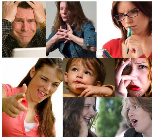
Figure 2. Types of messages conveyed by behavioural signals: (1 st row): affective/attitudinal states, (2 nd row, clockwise from left) emblems, manipulators, illustrators, regulators.

behavior analyzers should at least include facial expression and body gestures modalities and preferably they should also include modality for perceiving nonlinguistic vocalizations. Finally, while too much information from different channels seem to be confusing to human judges, resulting in less accurate judgments of shown behavior when three or more observation channels are available (face, body, and speech) [2], combining those multiple modalities (including physiology) may prove appropriate for realization of automatic human behavior analysis.