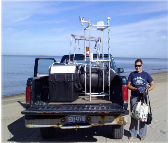
Fig. 1 Transporting equipment to the beach, July 2008.