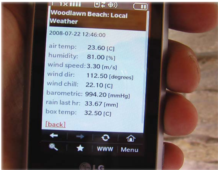
Fig. 5 Output of the local weather system on a mobile phone, July 2008