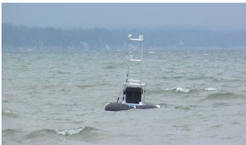
Fig. 6 Platform during a thunder storm, July 2008