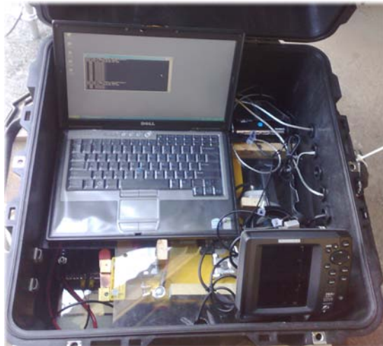
Fig. 2 Equipment box, interior, July 2008