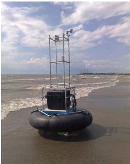
Fig. 3 Prototype buoy ready to be deployed, July 2008.