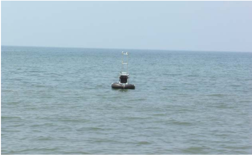
Fig. 4 Sensor platform in quiet waters, July 2008