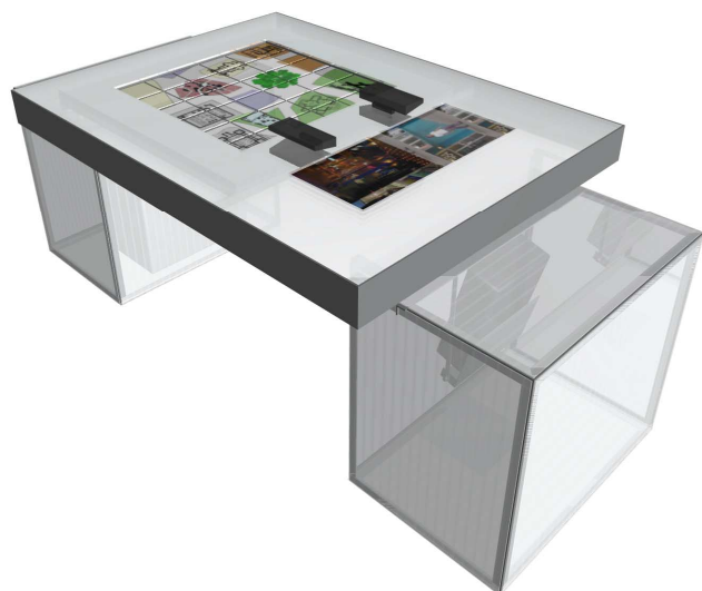
Figure 4: Second prototype of DT (CAD)

The current approach allows us to detect, with two noise reducing microphone arrays, laughter, change of tone, coughing, silence, and excitement via frequency and amplitude analysis of the speech signals over time. The frequency domain delivers information on the change of tone and on the vocal tract resonant frequencies, formants 1 and 2. Normalized power densities deliver intensity and excitement. Not all the above parameters are equally robustly detected. We are in the process of evaluating additional strategies of improving the system's performance and including additional salient parameters such as whispering. The classification of the signal level information is currently performed via a back propagation neural net. A first round of training data has been collected from multiple speakers in two languages (English, German). The outputs from the classification algorithm, collected simultaneously from two users, open a window into dinner discussion dynamics.