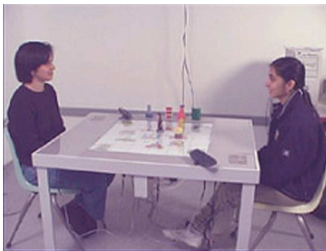
Figure 3: First prototype of DT

Figure control. The manipulator must be able to move two game pieces simultaneously through the urban game board landscape. We can achieve this with two planar tracks that are in turn mounted in a