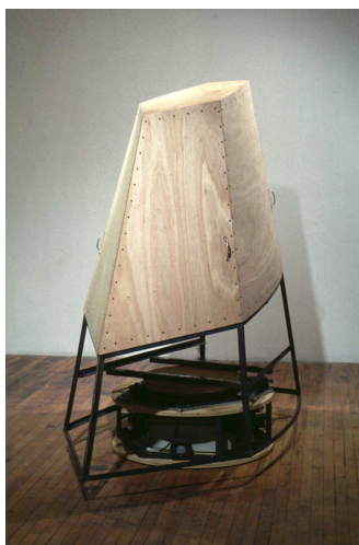
Figure 1: Norman White, "Helpless Robot, 1996"

The Institute for Applied Autonomy [2] has created a series of robots that address ideas surrounding the impact of automation and robotics on freedom of speech. Their best-known work, Graffiti Robot , is a remote controlled mobile robot that can be programmed to spray short texts onto sidewalks and streets. While the means employed to create this machine are very simple, the question that the work raises is more subtle. If a robot sprays graffiti onto a street, who is responsible for its content?